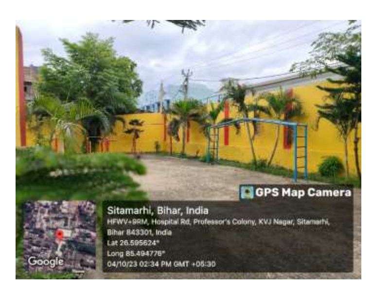
Fig 13 Open gymnasium with greenery