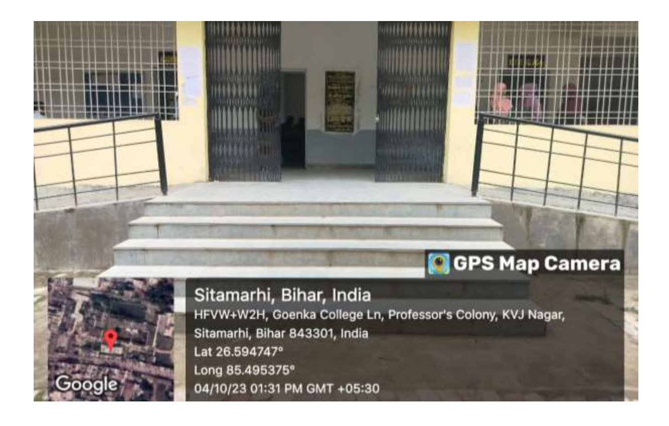
Fig 2 Neat & Clean Arts and Commerce Block