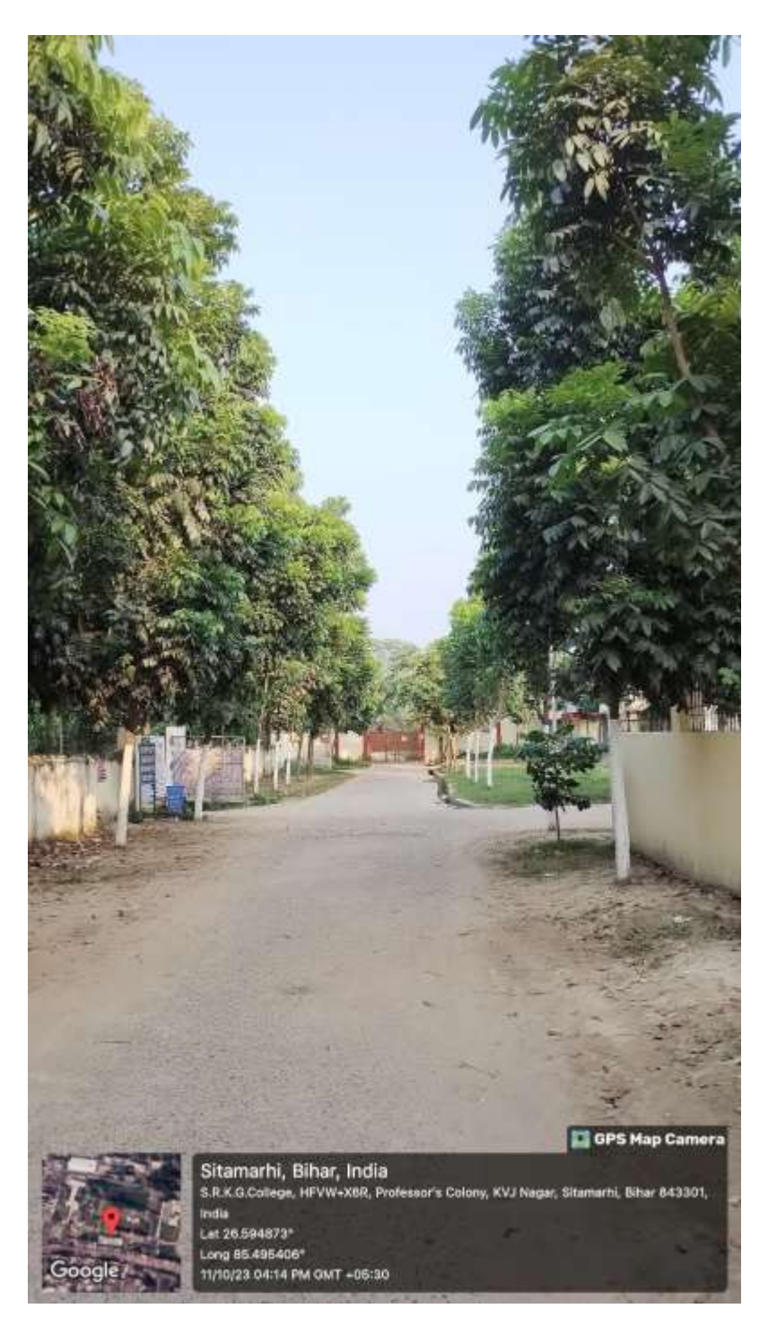
Fig 12 clean and green college campus