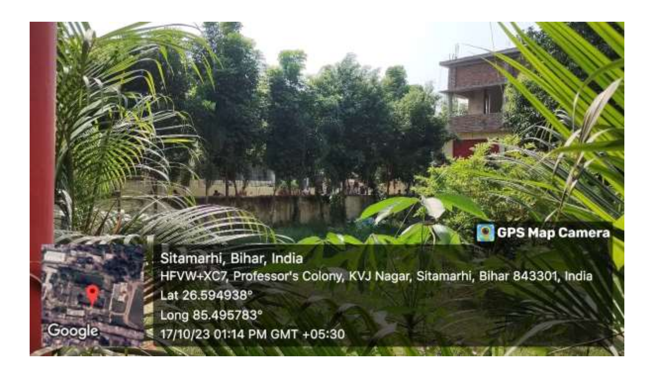
Fig 8 As a green campus initiative lush green garden in Science faculty