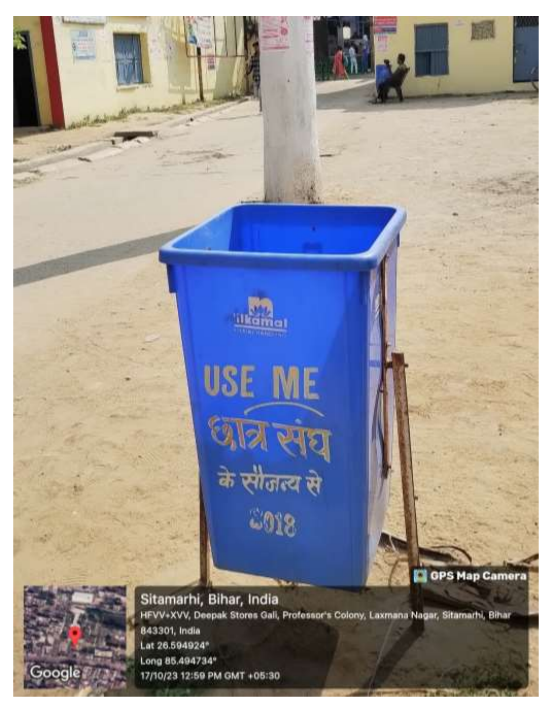
Fig 6 C Dustbin installed at various key locations to collect dry wastes as clean and green campus initiative