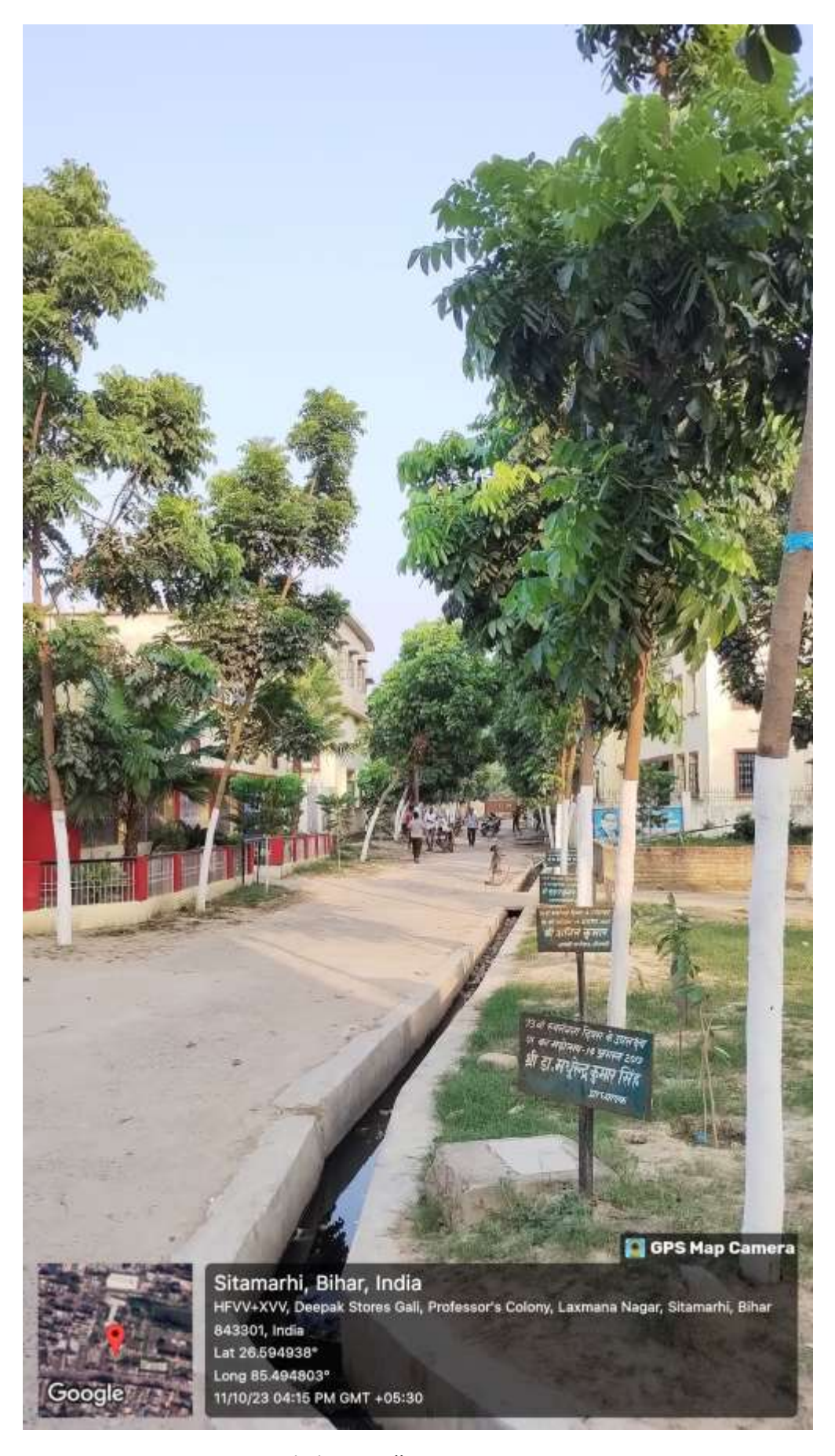
Fig 10 As a green campus initiative in college campus on 15 Aug 2019