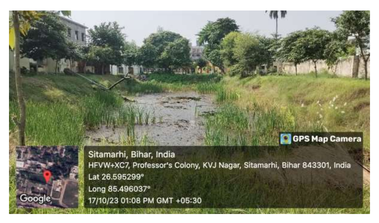
Fig 5 Rain water storage cum laboratory pond with green vegetation