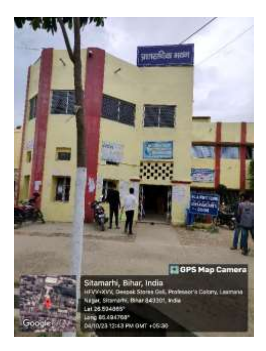
Fig 3 D Neat and Clean Administrative Building