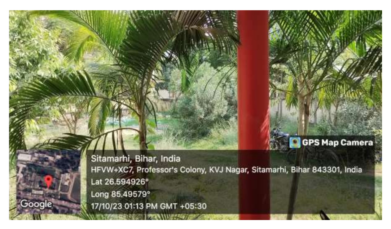
Fig 9 As a green campus initiative lush green garden in Science faculty