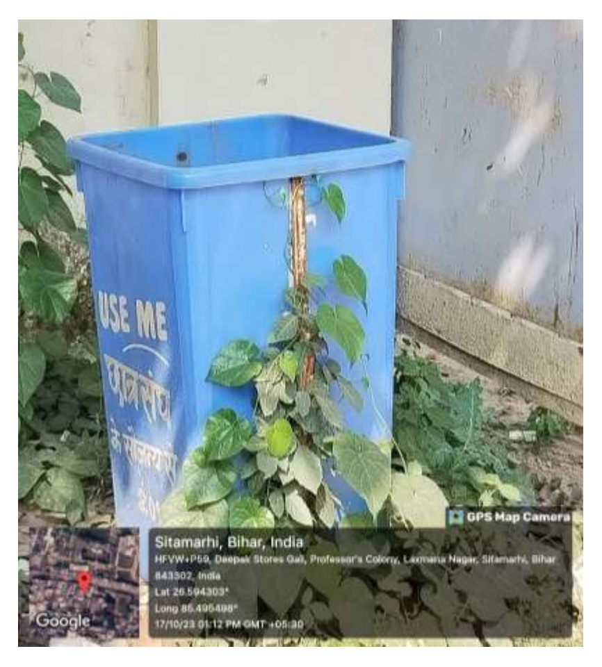
Fig 6A Dustbin installed at various key locations to collect dry wastes as neat and clean initiative