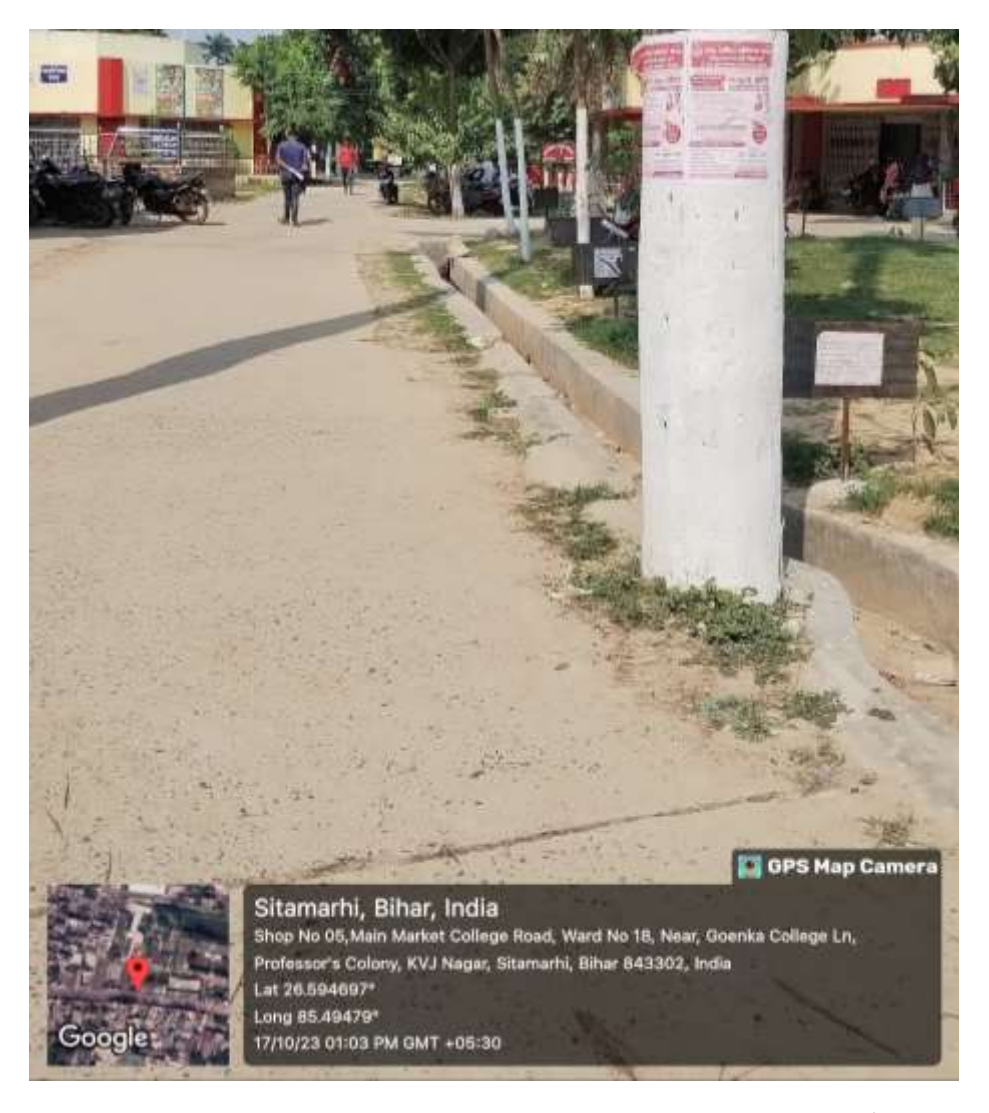
Fig 4 Rain Water Harvesting and channelling to water catchment area /pond neat clean green campus