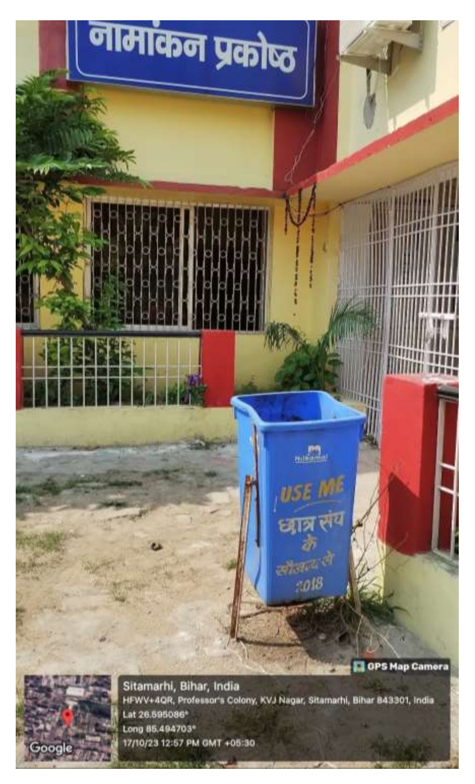
Fig 6B Dustbin installed at various key locations to collect dry wastes as a neat and clean campus initiatives