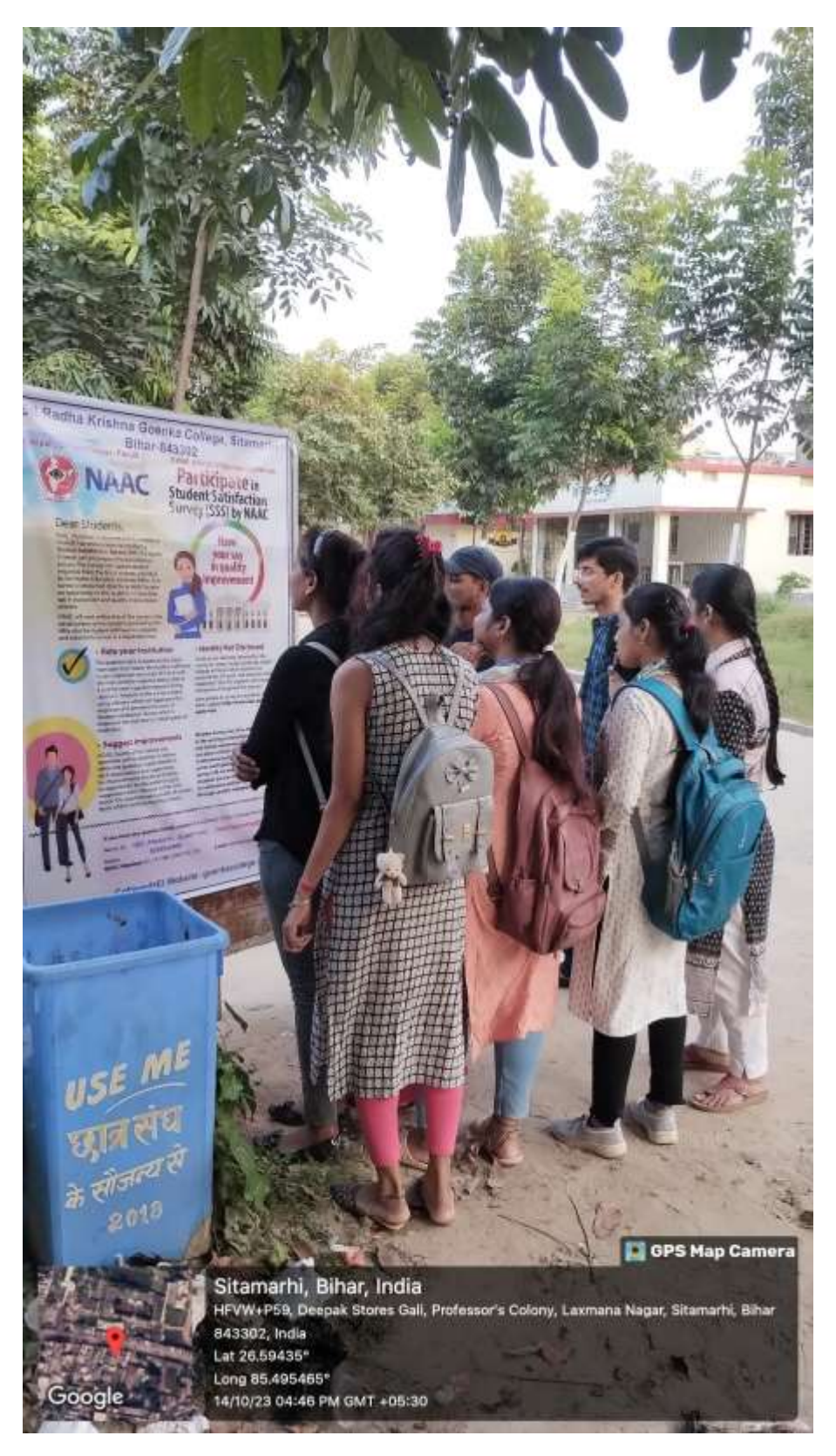
Fig 6 D Dustbin installed at various key locations to collect dry wastes