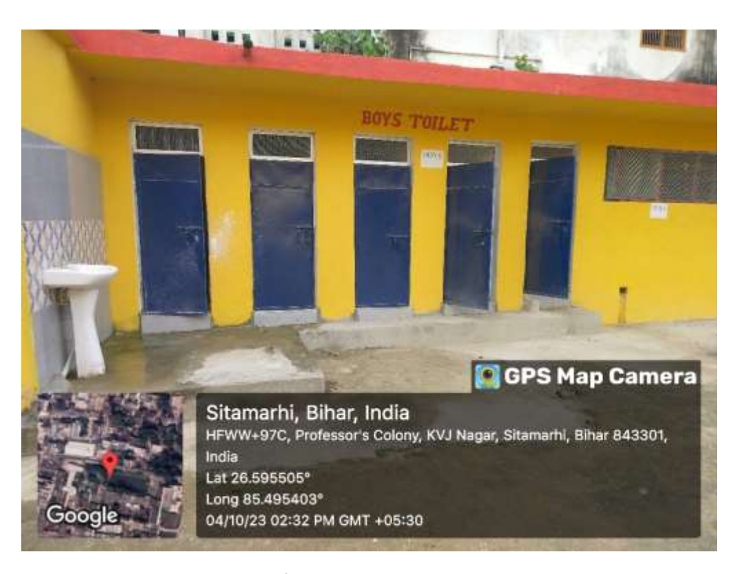
Fig 3B Disabled Friendly Barrier free clean and hygienic Boys Toilet