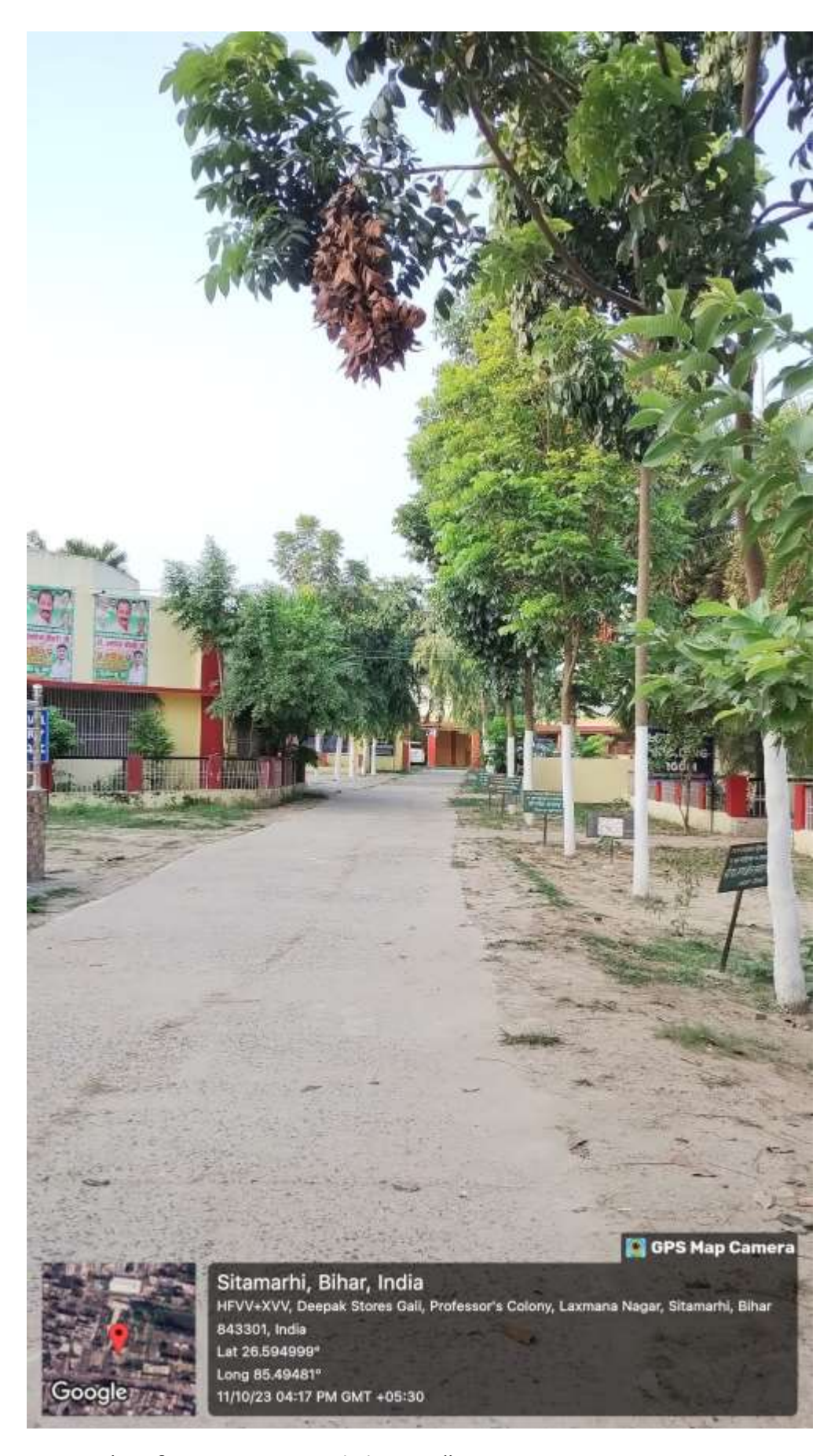
Fig 11 Clean & green campus initiative in college campus on 15 Aug 2019