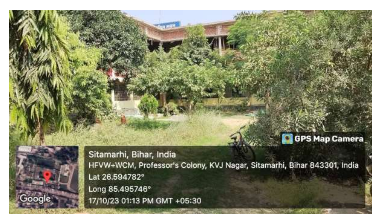
Fig 7As a green campus initiative lush green garden in Science faculty