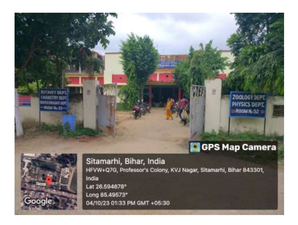
Fig. 3 A Neat And Clean and Green Science Faculty Main Entry Gate